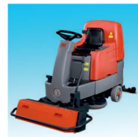
Pre Sweeper Kit