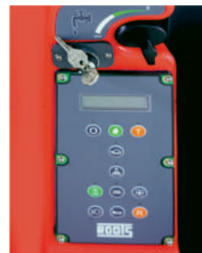
Various options available on the Opus board like Emergency stop, Slow, Eco & Dual modes for effective and safe operation.