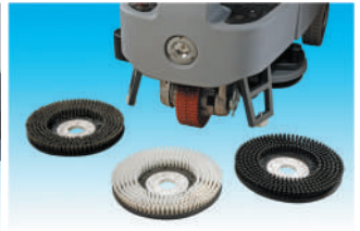
Variety of brush options available to suit different floors.