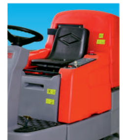
Ergonomically designed driver seat for comfort, easy access to all controls and good all round visibility.