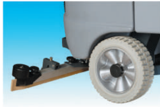
Large Anti Skid wheel for safe driving and operation on any floor.