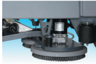
Brush release by foot. No tools required.