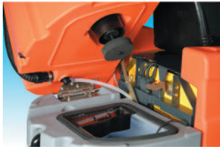
Dirt water tank can be easily cleaned - thanks for the easy accessibility and large opening.

Battery Operated Ride On Scrubber Drier • Choice of high traction batteries • Running Hours from 3 to more than 5 hours • Soft touch control panel • Provision for holding bottles, log book, manuals etc., as standard, close to the operator • Large Tanks for un-interrupted cleaning performance • Change of brushes and squeegee lips needs no tools • Break away Squeegee • In built fault diagnosis system • Reverse alarm • Head Lamp • Large Anti Skid Wheels.