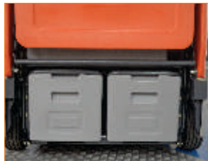
Easy to remove and dispose dual debris hoppers