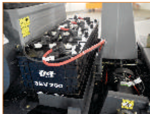
Four heavy duty deep cycle batteries provide extended run time and increased productivity

RELIABILITY: Rugged, High quality build, robust construction and essential mechanics ensure reliability