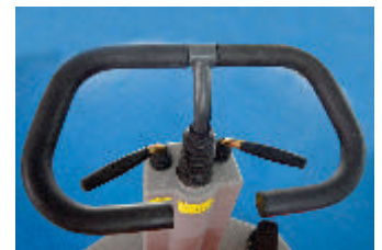
Brush controls mounted on the steering column, to facilitate effective and efficient cleaning operations

Suitable for cleaning Small to Medium sized areas - both indoor & outdoor, such as: