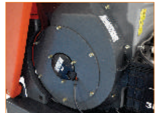
Exclusive Impeller Motor to arrest the flying dust