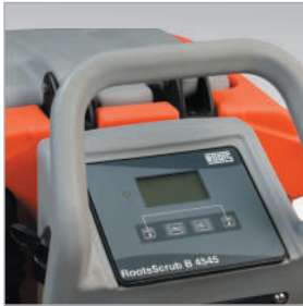
Ergonomic handle for operators of any height. Excellent view of the area to be cleaned. Soft touch buttons for selection of operation. LCD panel with display of hour meter, battery level.