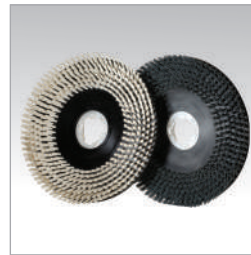
Variety of brushes to suit different applications.