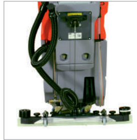
Professional self levelling Squeegee Ensuring Excellent performance