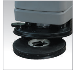
Brushes can be changed quickly without the need for any tools at the push of a button.