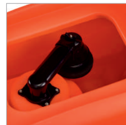
Large tank opening enables easy tank cleaning. Tank can be emptied quickly and easily via the large outlet hose. Overflow protection for the dirty water tank.