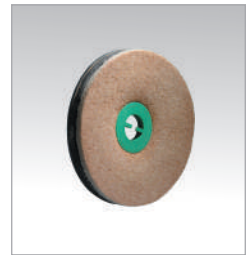
Pad holder available as option