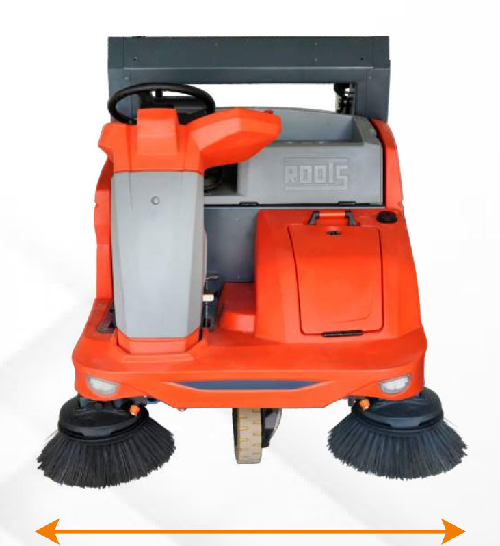
Sweeping width with both side brooms 1550 mm