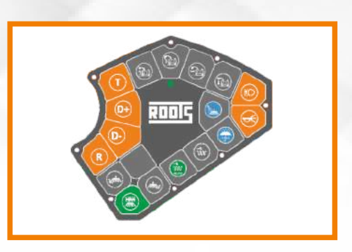
Ergonomically designed control panel view with one Soft Touch