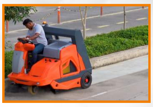
Excellent Sweeping, removes accumulated soil with ease